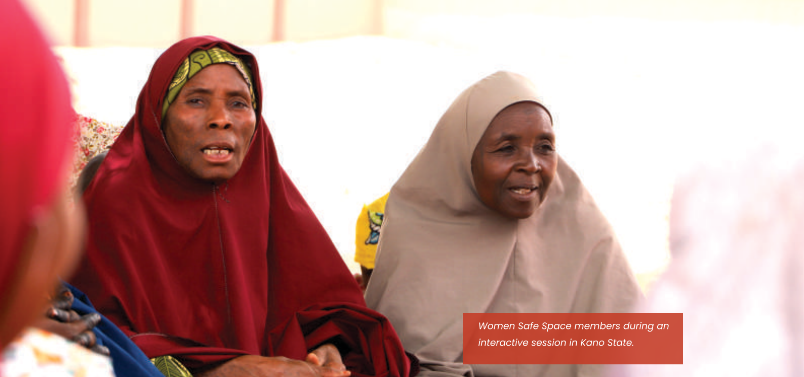
Women Safe Space members during an interactive session in Kano State.