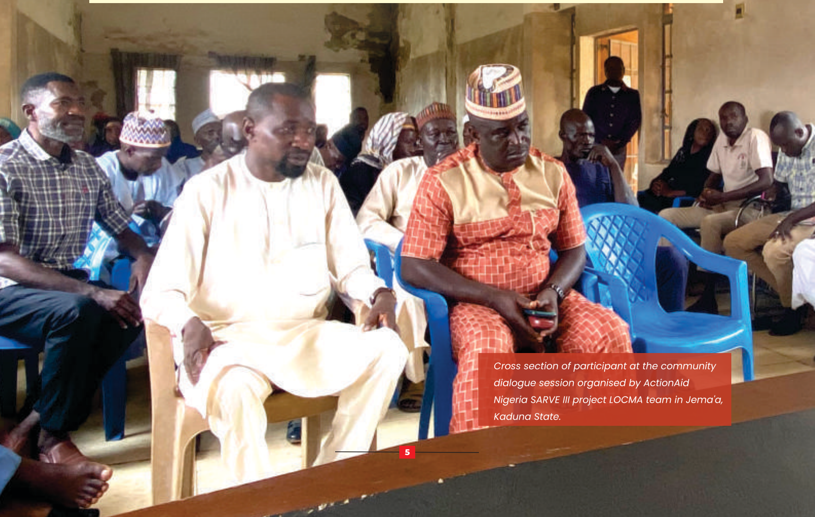
Cross section of participant at the community dialogue session organised by ActionAid Nigeria SARVE III project LOCMA team in Jema'a, Kaduna State.

The need for continued engagement and community dialogue in the region cannot be over-emphasised as it would not only build trust along ethnic and religious lines but also improved the livelihood of the people who reside in the region.