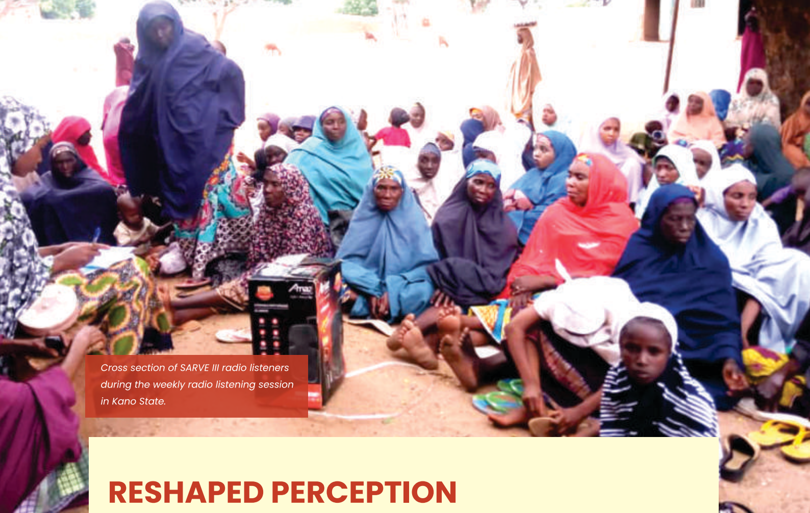
Cross section of SARVE III radio listeners during the weekly radio listening session in Kano State.