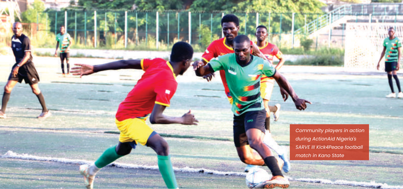
Community players in action during ActionAid Nigeria's SARVE III Kick4Peace football match in Kano State