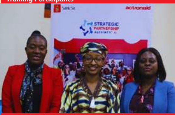
A photo section with the representative of the Youth Minister

Group photograph of the Young Urban Women Training Participants