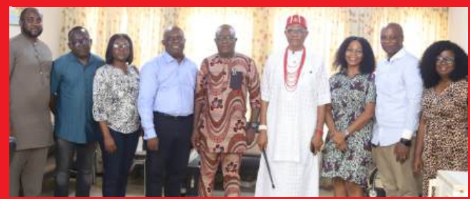
Group photograph with the Enugu State Indepence Electoral Commission Chairman during a courtesy visit