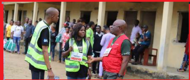
AAN Election Observers at the Akwa Ibom State LGA Elections