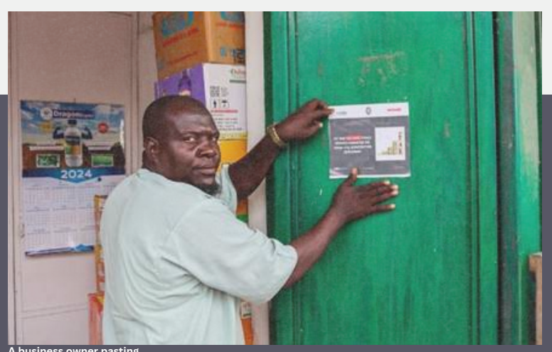
A business owner pasting the Tax Edcuation <u>material in his shop</u>

This gap in understanding has contributed to revenue losses and inefficiencies in tax collection, impacting the funds available for critical local services. In response to these challenges, we took the step to coordinate young people and facilitating engagements with the Borno Internal Revenue Services to address the issue. Young people embarked on a street sensitisation to create awareness on the importance of paying taxes.