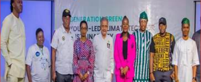
A group seection of panelists at the Lagos Climate Tech Innovation