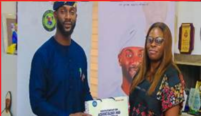
The Governance Manager with during a courtesy visit to the Lagos State Commissioner for Youth and Social Dev.

Group photograph of participants at the finance retreat