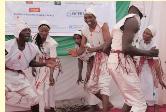
Participants displaying the Fulani culture during the 2022 Peace Fiesta in Kaduna State, tagged - EMBRACE DIVERSITY, BUILD PEACE , organised by ActionAid Nigeria in partnership with Global Peace Development (GPD) and in collaboration with Kaduna State Ministry of Culture and Tourism.