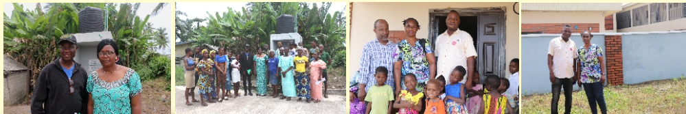
ActionAid Nigeria hosted Community Sponsors in Abuja and Lagos on her first Supporters Community Visit to Vine Heritage Home Kuje, Abuja, and Wesere community Badagry, Lagos, in celebration of 2022 Customer Service week.