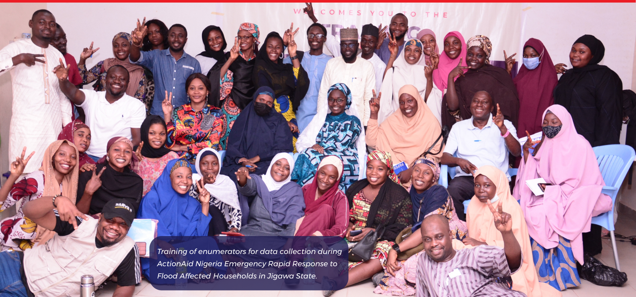
Training of enumerators for data collection during ActionAid Nigeria Emergency Rapid Response to Flood Affected Households in Jigawa State.