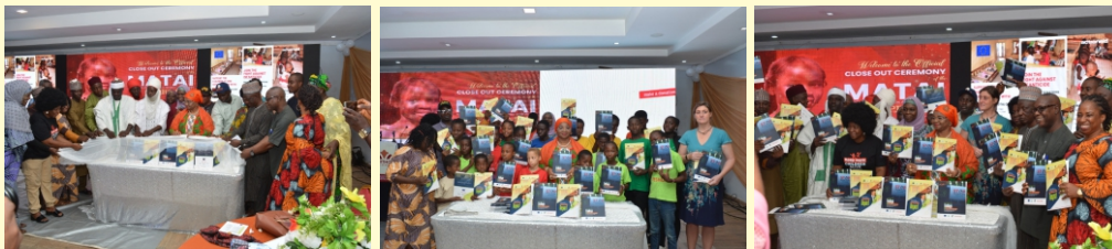
The Closeout ceremony of the MATAI Project