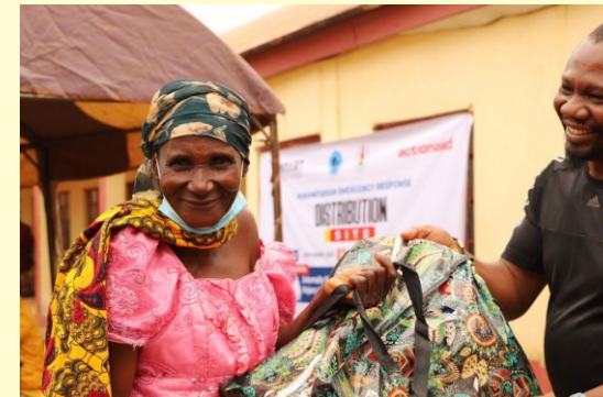
ActionAid Nigeria (AAN) and her local partner Global Peace Development (GPD), with funding support from STARTFUND has provided emergency relief materials to three thousand (3,000) women-led households across sixty-one communities displaced by banditry and temporarily living in host communities in Kaduna State.